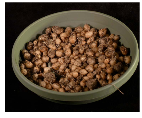
Pterostylis curta tubers out of their old mix, ready to plant