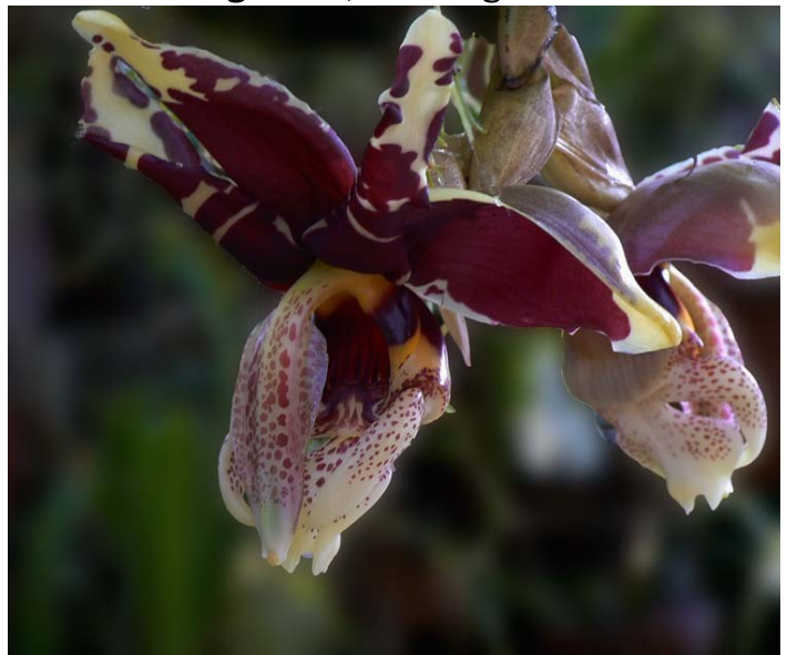
Stanhopea nigroviolacea bloomed without me <sigh>

xantholeuca has been used in quite a bit of hybridizing with Sob. macrantha (Sob. Veitchii, Sob. Mirabilis, Sob. Colmaniae). It may "improve" some characteristics, but to my eye, the species is the most attractive of the lot, with the most intense color. Like other Sobralias, the individual flowers don't last long, but the plant produces flowers sequentially, staying in bloom for a month or more. Also, it seems to be a fairly compact plant (relative to some of its cousins).