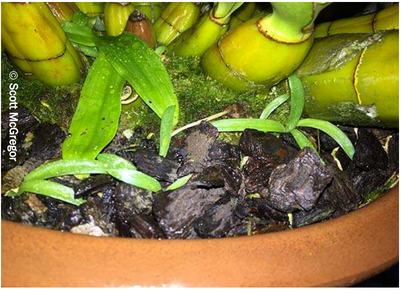
Cynorchis fastigiata "infestation"

There are perhaps a dozen plants in the original Dendrobium pot, and it has sprouted in pots all over my growing area, seemingly transported long distances from the original plants. They seem indifferent to the amount of light or growing medium. They'll all disappear in another month or so for their winter dormancy, but I know they'll be back in force next Spring, and I'll probably get quite a nice display of flowers next June. I haven't yet developed the resolve to dig them out of