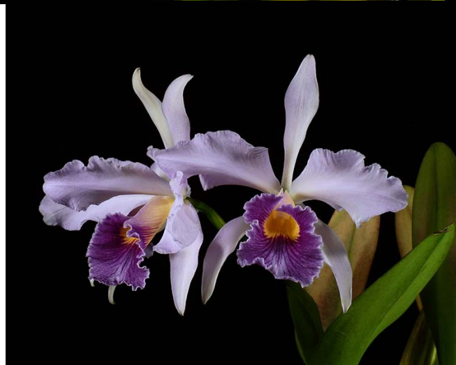
My First Laelia (Cattleya) purpurata of the season

its hybrids are starting to pop, and for those of us who grow them outside, Laelia (Cattleya) purpurata . (The ones grown in a greenhouse have been in bloom for at least a month.)