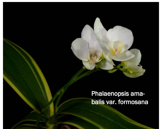
Phalaenopsis amabilis var. formosana