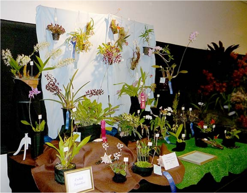
SCOSS Display Beribboned