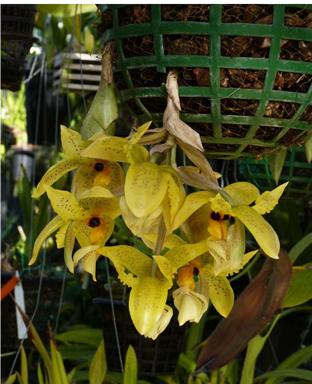
Stanhopea wardii 'Los Vientos Encinitas'

Cynoches cooperi put on a beautiful, fragrant display. The flowers lasted about two weeks, which in my experience, is quite long, especially for male flowers (the female flowers seem to last a bit longer) While nearly all of my Catesetinae (including the ones that bloomed earlier in the season) still are very green, this one started to drop its leaves while the flowers were still fresh. So for this one, time to stop watering and let it go dormant. If the others don't start to show signs of dormancy in the next month or so, they will have to be pushed in that direction by withholding water. I grow this whole group in the greenhouse... tried a couple out-