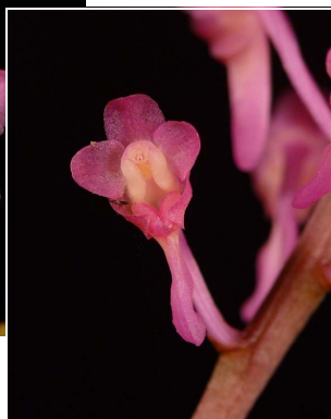
Aerides ringens before and after hummingbird