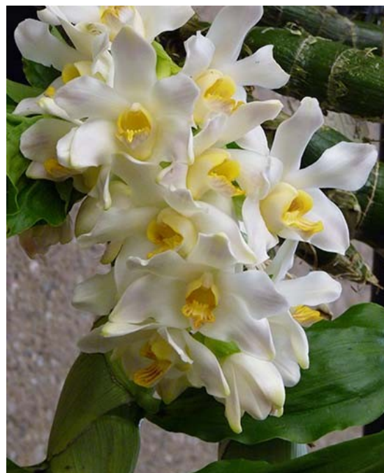
Chysis bractescens plant and inflorescence

Caribbean, but has also been seen on Pacific-facing slopes in El Salvador. The plants grow as epiphytes in wet mountain forests, mostly below 2800 ft (850 m) but have been found somewhat higher in Nicaragua.