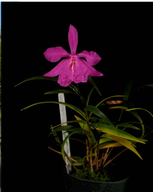
The long and short of it... Sobralia caliglossa and Sobralia callosa