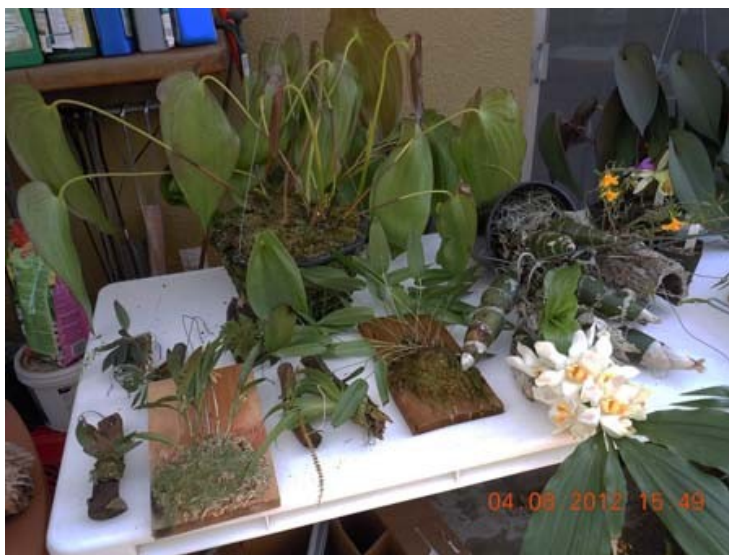
A bit of the Show and Tell table at the April meeting