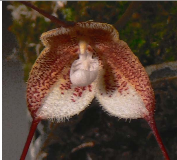
Dracula erythrochaete close up