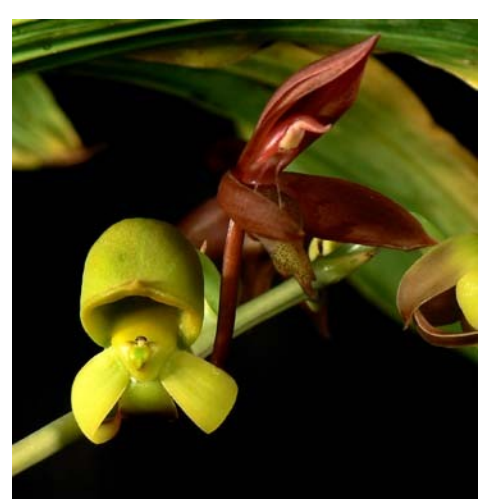
Catasetum callosum Female and Male Flowers

many illustrations of orchid people Darwin knew as well as the plants he used to tell the story.