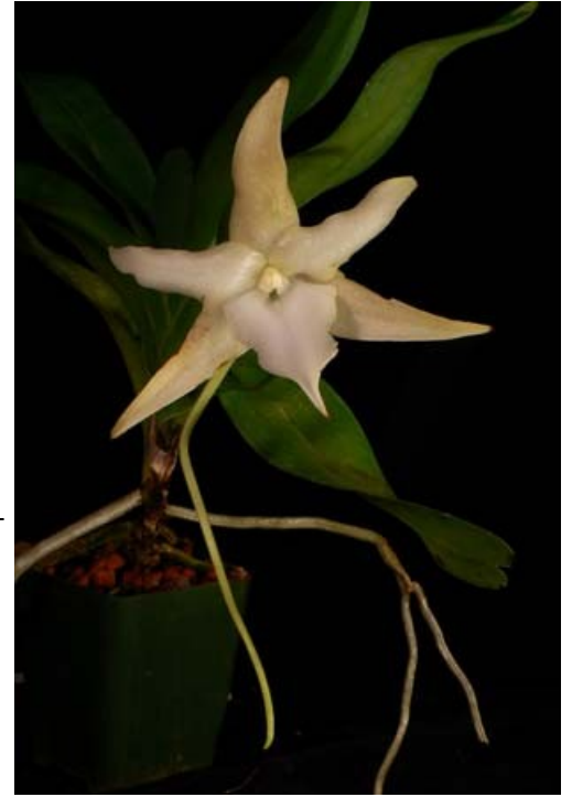
come from? The Paph Angraecum sesquipedale