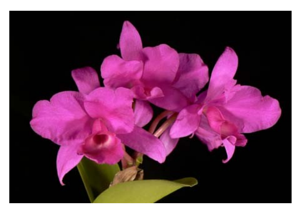
Guarianthe (Cattleya) skinneri

In the process of searching for cultural information about a new acquisition, I found a guide to Ecuadoran orchids, with 200 pictures and location information. The link is http://fm2.fieldmuseum.org/plantguides/ guideimages.asp?ID=274, and it is within the website of the Field Museum in Chicago. The home page for a large group of references to tropical plants is <a href="http://">http://</a> fm2.fieldmuseum.org/plantguides/default.asp. Under Rapid Color Guides search for Orchidaceae, and you will find several references. The one I used was Pichincha-Maquipucuna Orchids. What was I looking for? I won an Elleanthus gramminifolius from a plant table. The genus Elleanthus is related to Sobralia. For most that I have seen, the plant looks very similar, but the flowers are tiny and grow in a cluster. This plant is much smaller than the ones that I'm familiar with, and has very thin grass-like leaves.