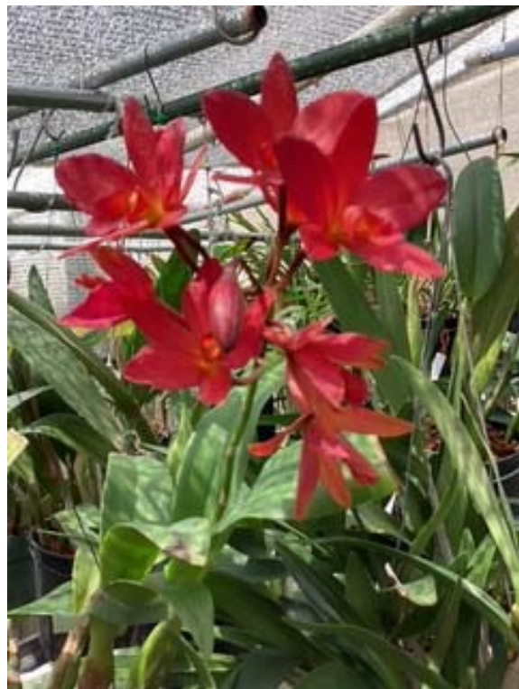
Lc. Rojo x Ctna. Why Not