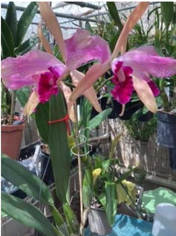
( L. sanguiloba x L. tenebrosa 'Best') x L. purpurata f. flamea 'Darkest'