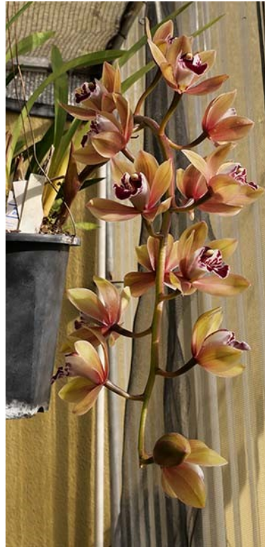
Cym. Knute Kid

This Cym. dayanum is blooming a couple of months later than my other ones. It has 8 spikes, but rather than a flush bloom, it is opening them a few at a time.— a longer bloom but not as showy.