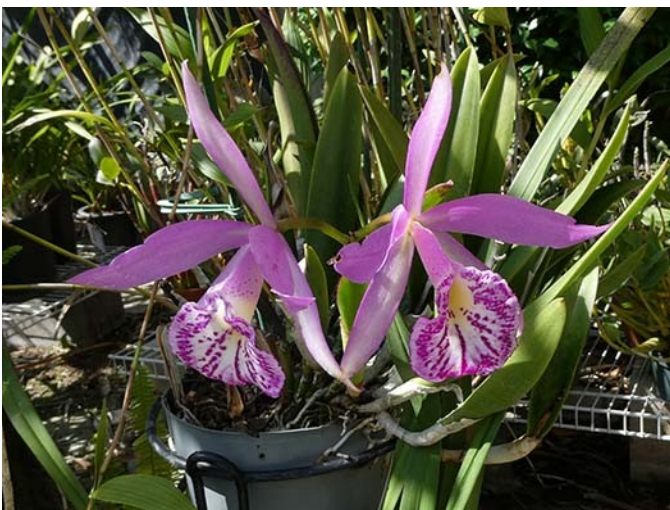
Bc. Tetradiip 'Junko' newly opened