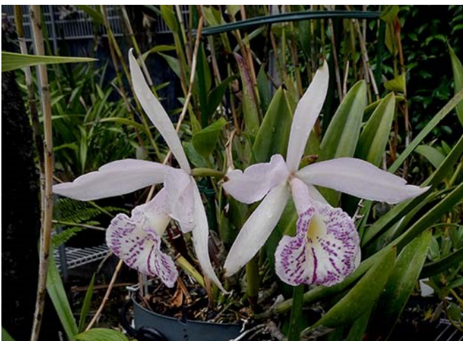
Bc. Tetradiip after about a week