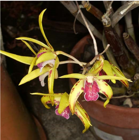
Den. [Autumn x (Regal Affair x Aussie Victory) ]

Here is an Australian Dendrobium hybrid that is starting the season early. I am seeing spikes on Den. speciosum plants, and think this will be a good year. Last year was rather sparse for those (other people has the same experience) and I think they will make up for lost time.