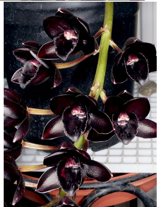
Fdk. After Dark 'Black Pearl'