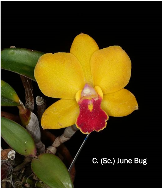
C. (Sc.) June Bug

My two Fredclarkearas didn't bloom until they were completely dormant. Fdk. Gemstones just finished, Fdk. After Dark is still blooming. Both lost their leaves nearly two months ago. These do live in the greenhouse during the winter months. They'll move outside in the spring, when they are actively growing and nights are above 55 deg F. They'd do just fine in the house in the absence of a greenhouse.