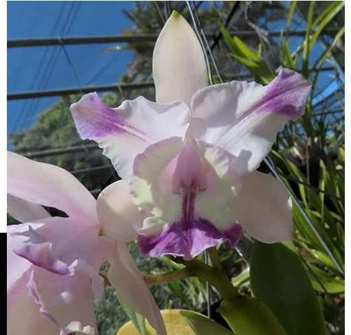
C. intermedia f. aquinii coerulea 'SVO Blue Flare'

Cattleya intermedia grows very easily outside, and this is its season. It comes in a variety of color forms and patterns. Here are two coerulea forms— orlata (a ring of color on the lip) and aquinii , the peloric form.