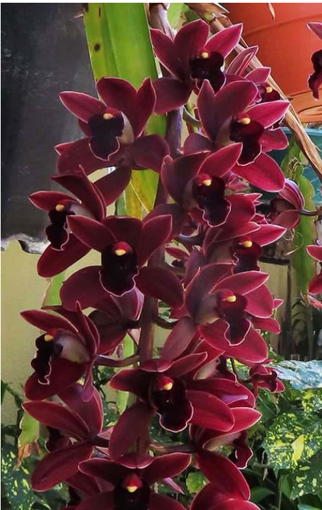
Cym. Cali Night 'Geyserland'

While the Cymbidiums are past their peak, there are still a few putting on a show. This is the best bloom that I have had in a very long time from Cym. Cali Night—6 pendant spikes of velvety, dark burgundy flowers. And Cym. Whitney Houston has big flowers, with nice form and sunset colors.