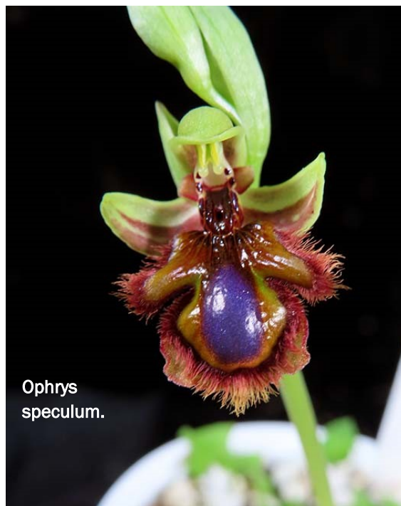
Ophrys speculum .

my European terrestrials, Ophrys speculum . It's a perfect little bug.