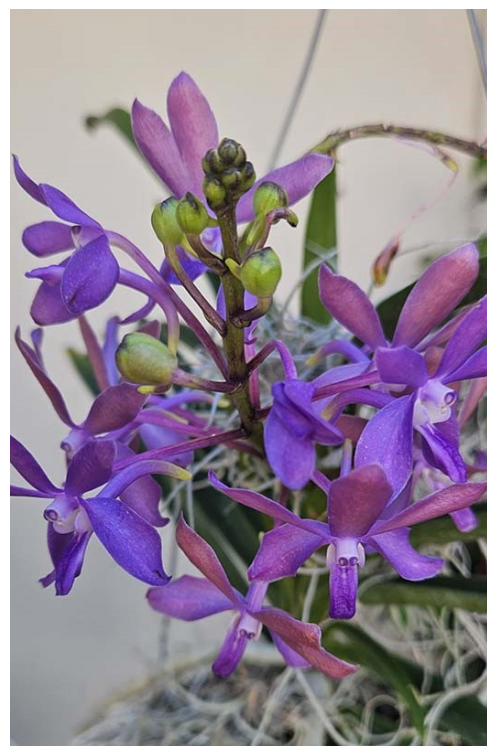
Vandachostylis (Darwinara) Charm 'Blue Pacific'