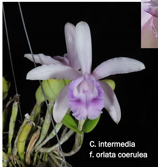
C. intermedia f. orlata coerulea

Dendrobium papilio comes in a large-flower and small-flower form. While the small flower form tends to be more floriferous, this large-flower form put on a spectacular show. Each flower is about 3 inches. It blooms on bare, leafless canes. Imagine