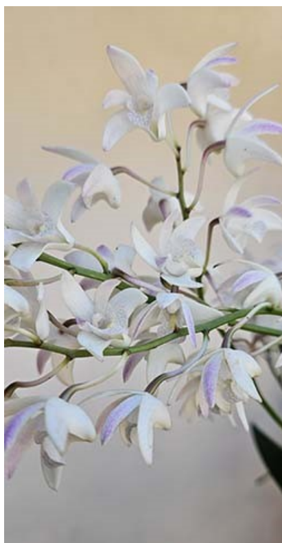
Dendrobium Delicatum (Specio-kingianum)