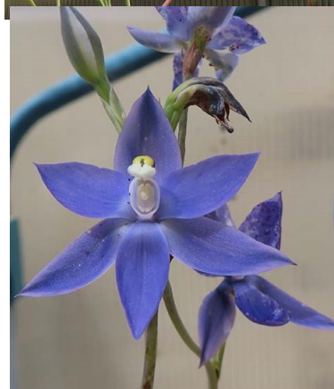
Above, a bunch of Thelys . Left, Thelymitra nuda 'Royal Blue'

When it's cloudy, they close up. So one will never see them at a night meeting, and at least so far not at any judging center.