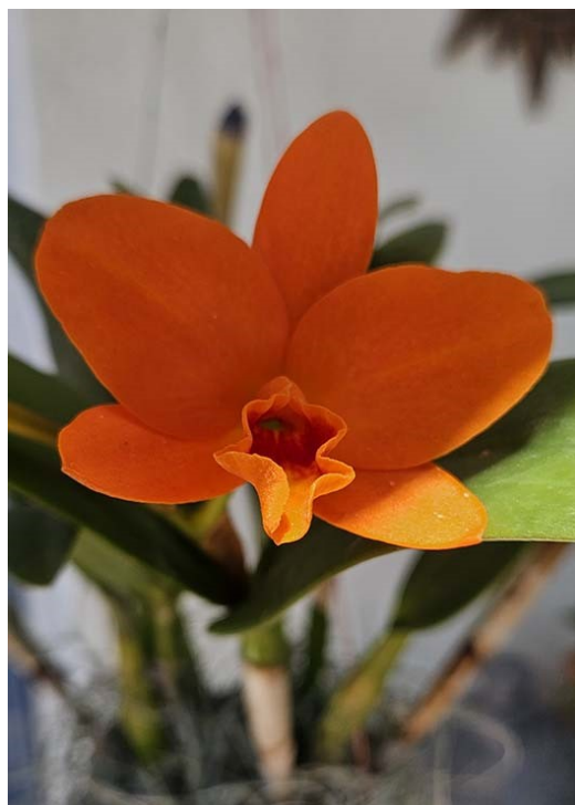
Rth. Shinfong Little Sun