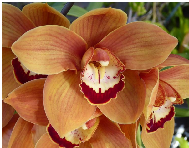
Cym. Whitney Houston

Cattleya intermedia grows very easily outside, and this is its season. It comes in a variety of color forms and patterns. Here are two coerulea forms— orlata (a ring of color on the lip) and aquinii , the peloric form.