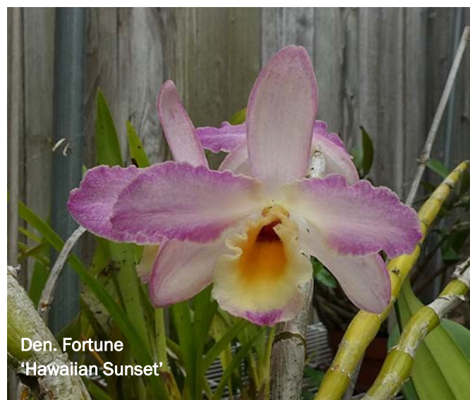
Den. Fortune 'Hawaiian Sunset'

Deciduous Dendrobiums (wintertime, look dead but they aren't) are blooming profusely. Native to the Himalaya foothills and southeast Asia highlands, they don't get much rain in winter but receive overnight dew so they aren't completely dry. I don't dry mine out at all and they seem to bloom fine anyway. The Den. nobile hybrids may not even lose leaves. Same treatment. Den. Fortune has bloomed reliably for me for many years. It's one of the early survivors after I figured out to ignore the advice to dry it out from Halloween to Valentine's Day... killed several of this type before I learned better.