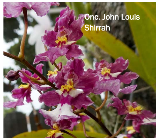
Onc. John Louis Shirrah

Oncidium John Louis Shirrah is a primary hybrid of Onc. hyphaematicum (big and tall) and Onc. sotoanum (formerly ornithorhynchum) which is small, and fragrant. It mostly takes after its sotoanum parent, and is sweetly fragrant.