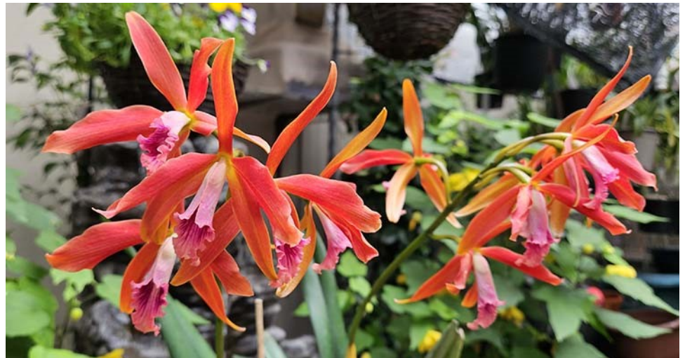
Cattleya (Laelia) Zip ( milleri x tenebrosa ) Both parents have been reclassified from Laelia to Cattleya