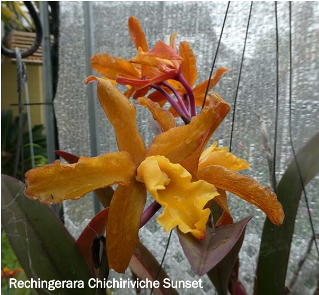
Rechingerara Chichiriviche Sunset

I'm never sure whether to call Cym. Kuranda (madidum x suave) "late" or "early". It is blooming right on schedule, the last of the Cyms to bloom in the late spring, just before the summer bloomers like Golden Elf. Here are two cultivars, one a bit darker than the other.