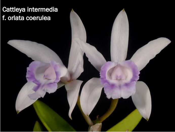
Cattleya intermedia f. orlata coerulea

bottom of the pots so that there is a significant zone for the roots that is open and airy above the water. However, on several plants, the roots have gone down thorough the rocks and out the holes in the pots, swimming happily in the water. The species does grow by running water, and roots reach into the streams. In the summer they are outside in my Disa fountain, where they benefit from a somewhat higher light level than they have in the greenhouse. In winter, they do move into the greenhouse, in a pan with an aquarium bubbler to keep the water aerated and moving. This has turned out to be much easier to manage than the submersible pump that I use in the "fountain". If I had it to do over again, I'd just use a larger bubbler rather than the pump. Since the bubbler does not sit in the water, there is no clogging, or concern that it might burn out if it goes dry.