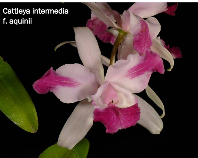
Cattleya intermedia f. aquinii

I have been growing Phragmipedium besseae in circulating RO water, and my plants are growing vigorously. I have them potted with about an inch of stones at the