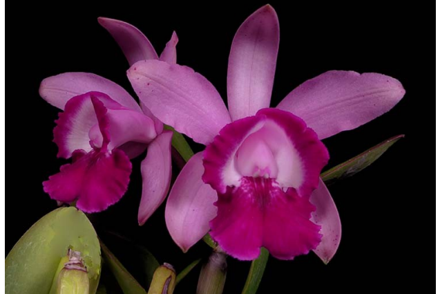
Cattleya intermedia f. orlata

comes in a variety of color forms. The peloric (petals with lip-like markings) aquinii form is in the parentage of many splash-petal hybrids. The orlata form has the lip color extending around the side lobes. There are also coerulea forms, and combinations. This species is blooming quite prolifically right now.