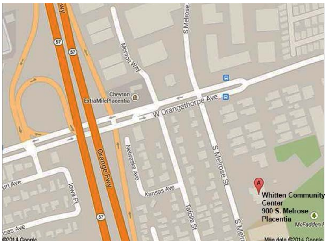
Location of March Meeting (Where we met in November)