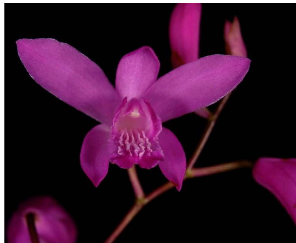
Bletilla striata , typical and alba