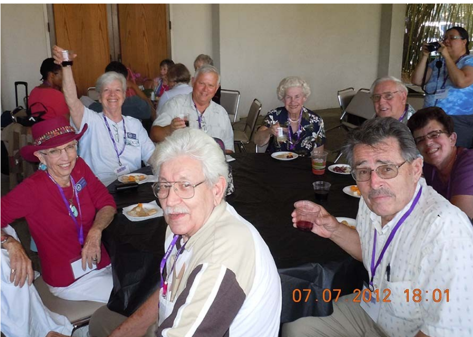
The "SCOSS Table" at the Orchid Digest Speakers Day dinner