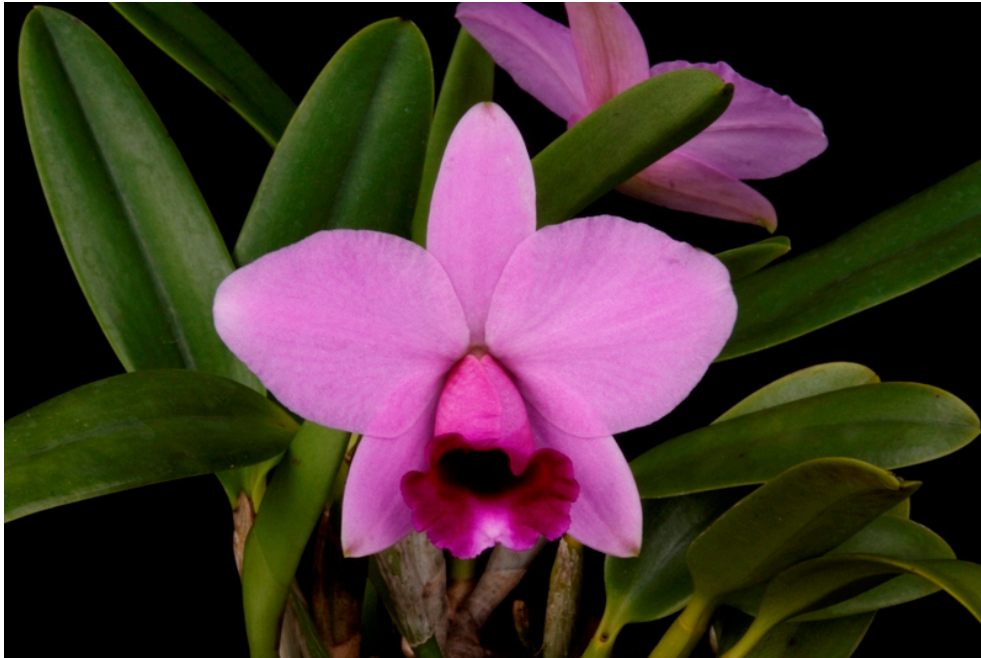
Cattleya praestans 'Danni'