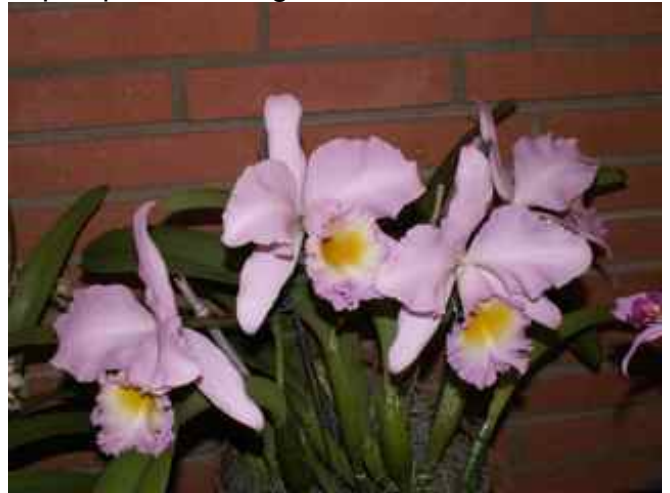
Blc. Nacouche 'Pink Feature'