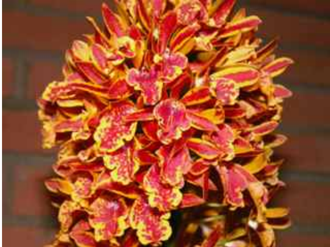
Eplc. Volcano Trick 'Fireball'