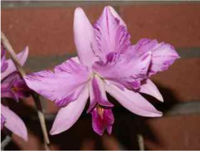
Laelia anceps var. lineata 'Doris'