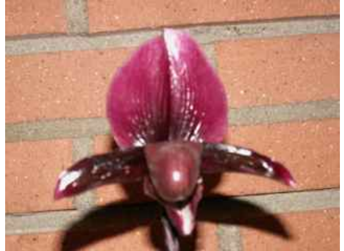
Paph. (Ruby Mist x (La Ser x charlesworthii))