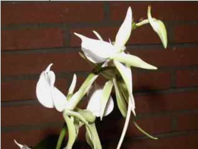
Angraecum ( giryamae x comorense )